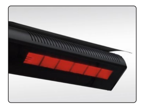
An optional Heat Shield can be installed to reduce the clearances above the heater

all the great features and benefits of SunStar's new GLASS™ radiant patio heater and how it can help to maximize your profits.